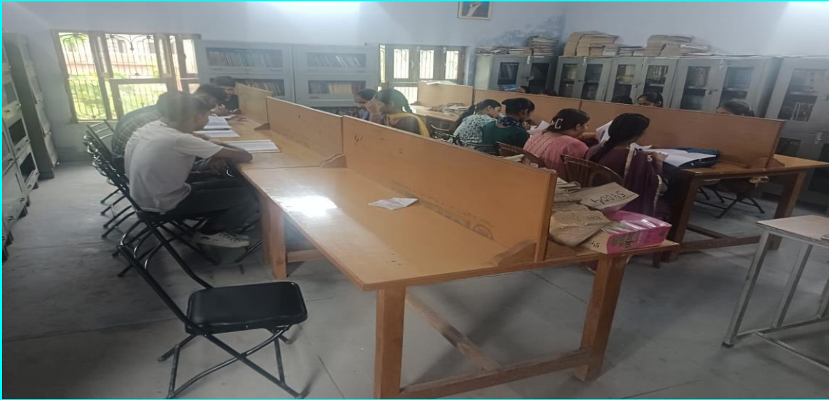
Student's usage of Library Resources