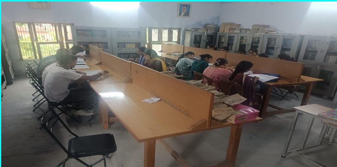
Reading Room having Capacity of 40 Students