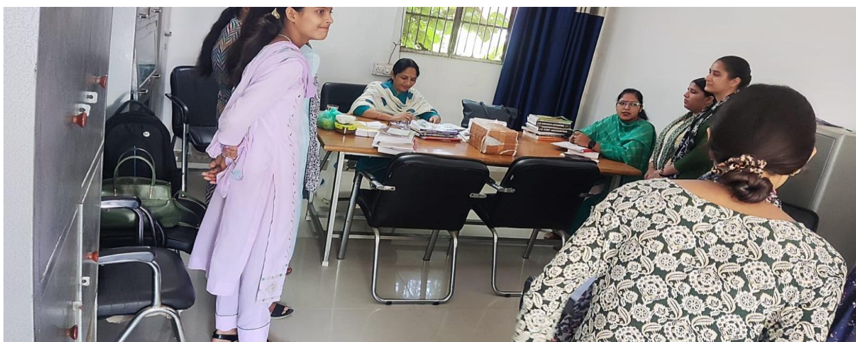
Faculty members counseling the students