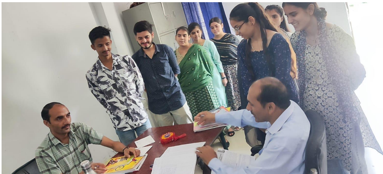
Faculty members counseling the students