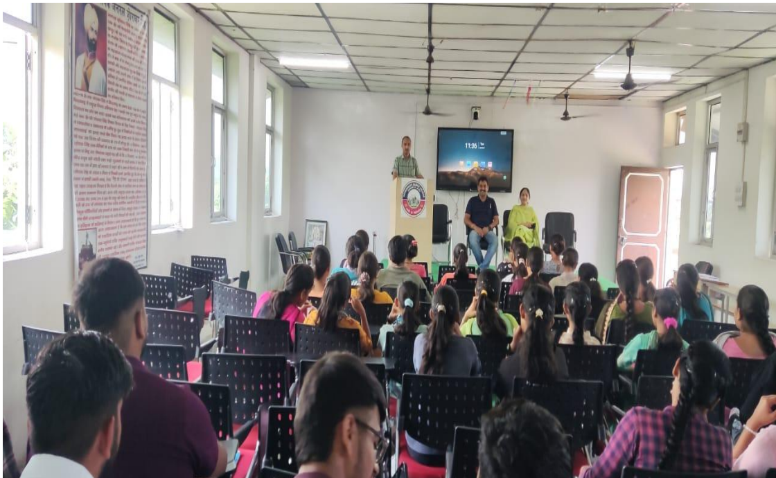
Post-admission Counseling (orientation of 1 st year students)