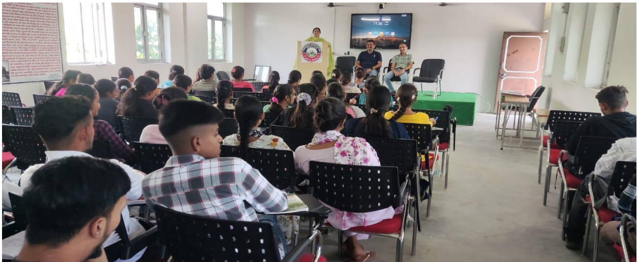
Post-admission Counseling (orientation of 1 st year students)