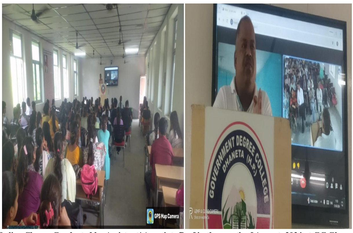
Online Classes Conducted by Assistant/ Associate Prof.in the month of August, 2024 at GC Glore